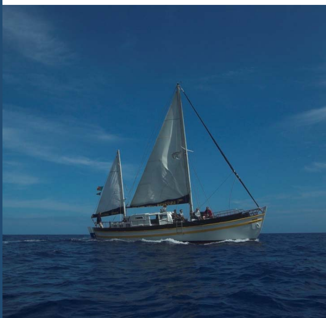
Ventura do Mar sailing in Madeira Island