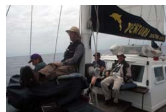
On the way to Selvagens Islands