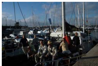
Leaving Funchal Harbour