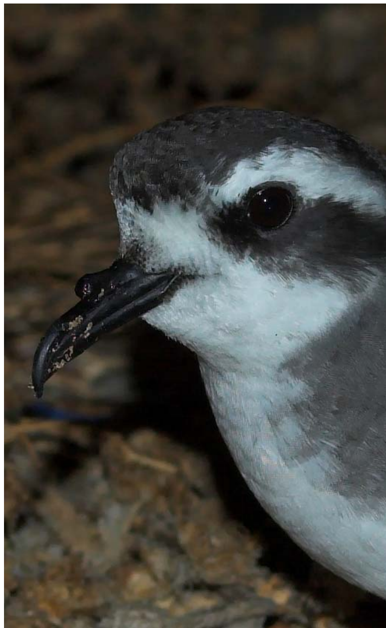
White-faced Storm petrel